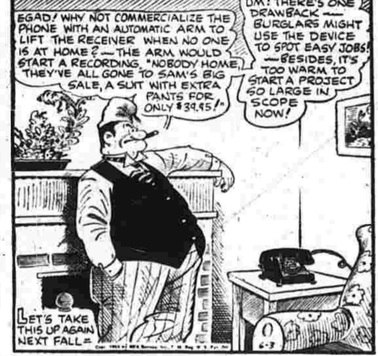
A Skeptic BY V. T. HAMLIN